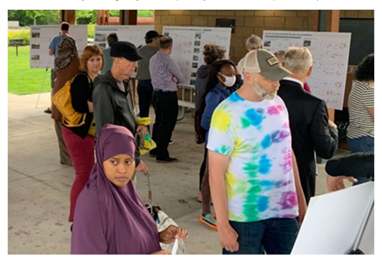
Figure 5.1: Public Open House. During a public open house held in Cottageville Park in early July 2021, dozens of participants used dot voting to indicate their design preferences for the public spaces in the proposed development.

A design preference survey was conducted online and during two public open houses, a virtual event held on Wednesday evening, June 30, 2021 and an in-person event at Cottageville Park held on Wednesday evening, July 7, 2021 (see Figure 5.1: Public Open House ).