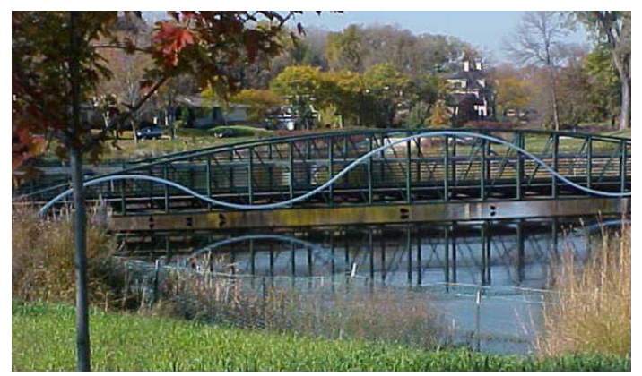
Walking bridge over Calhoun Pond, one of the many projects involved in the Chain of Lakes partnership

By collaborating to align goals and leverage resources, the MCWD and its partners achieved significant and lasting results. This spirit of partnership can be seen today as the MCWD embarks on a joint effort with the Minneapolis Park and Recreation Board and the City of Minneapolis to investigate opportunities to improve the health and recreational enjoyment of Minnehaha Creek.