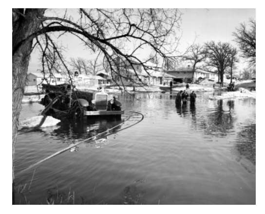
Minnehaha Creek flooding in St. Louis Park, 1965

In the mid-1960's, flooding along Minnehaha Creek prompted residents to petition for the formation of the Minnehaha Creek Watershed District, which came into existence on March 9, 1967. Its first order of business: build an adjustable dam at the headwaters of the creek, where it flows out of Lake Minnetonka.