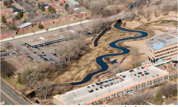
The creek after restoration