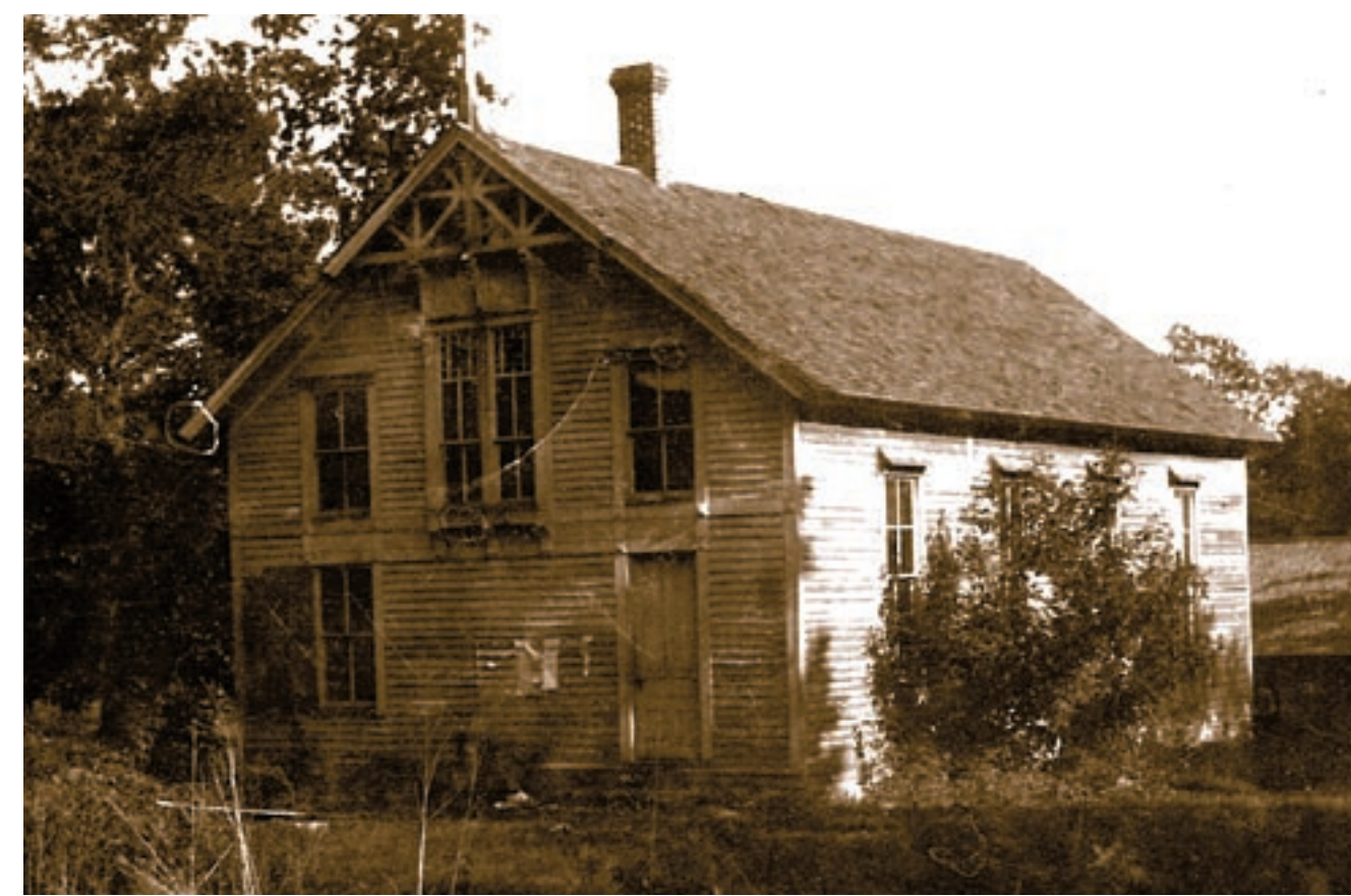
Edina Historical Society