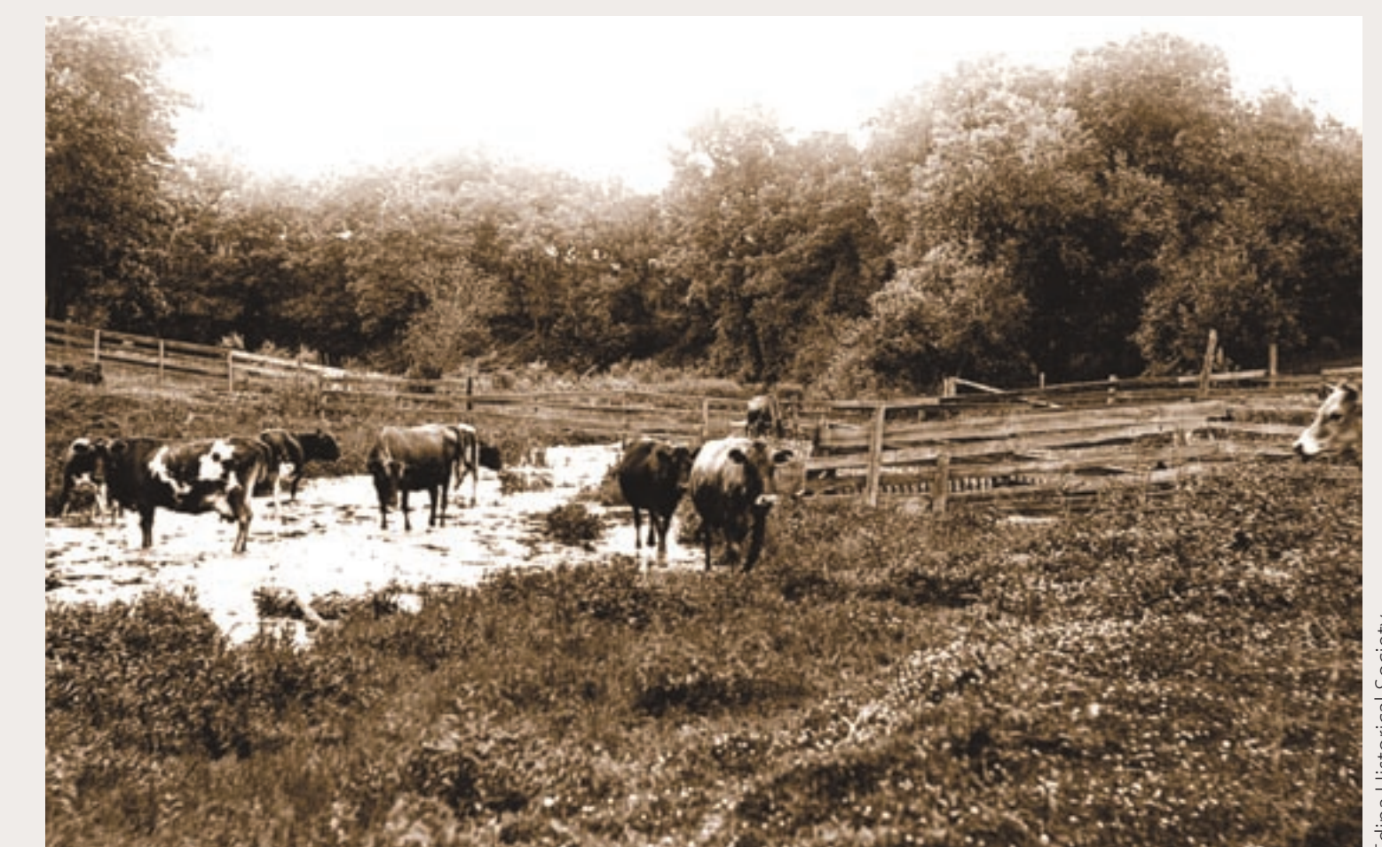
Edina Historical Society

Nationwide the Grange served as the glue of many farming communities. This area was no exception. The Bull family donated a parcel of land just a hundred feet to the west of here, which became the site of the local Grange hall. Along with the nearby Edina Mill, this meeting place gave rise to a vital community—a community that eventually became the City of Edina.