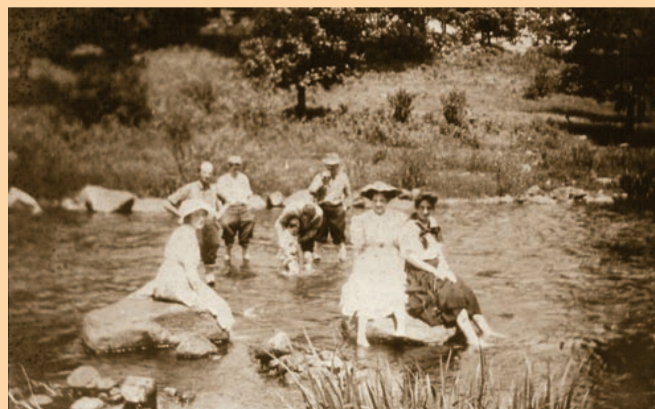
Beautiful countryside made this a popular destination for visitors.

Of course, the area was much more than a picnic ground. The farm was famous for fine strains of cattle and sheep, which grazed freely along the creek bed.